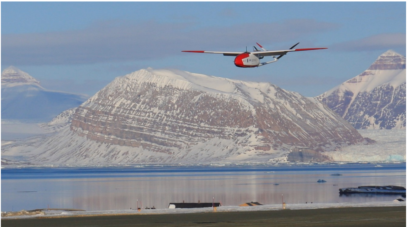
Figure 1: The Cryowing remotely piloted aircraft operated from Ny-Ålesund.

A combination of techniques needs to be applied to measure the elevation profile along the whole glacier. For the lower part of the ablation zone and terminus, the reflectance of the glacier surface is too low to produce reliable laser measurements with our current laser. However, crevasses, cracks and debris make lots of structures with high contrast. Hence, a technique known as multiple view photogrammetry can be applied to generate a digital elevation model (DEM) from a set of overlapping images with known position and orientation. This technique cannot be applied above the firn line, due to lack of visible structures, but in this area the surface reflectance produce strong laser returns.