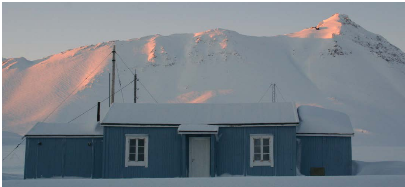
The old Telegraph building.