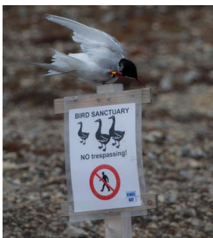
An Arctic Tern with a geolocator attached to a yellow ring has arrived in Ny-Ålesund and is waiting for its partner to start breeding.

Barnacle geese and arctic terns are prominent birds in the village. Moulting geese are aggregating on the high quality vegetation as long as arctic foxes and people don't disturb them. Arctic terns nest on the gravel areas. Dutch bird observers are walking through town with their telescopes to read rings, study behaviour and collect faeces for analysis of diet and hormones. Plastic and metal rings make individual recognition of individuals possible.