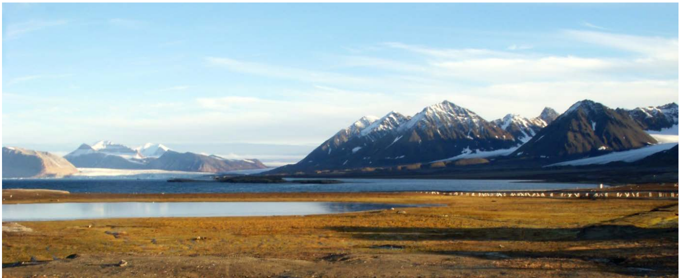
September 2010