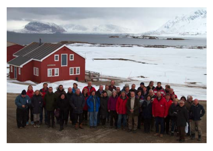
The participants gathered in Ny-Ålesund.

The Symposium was a great success with several interesting presentations and discussions.