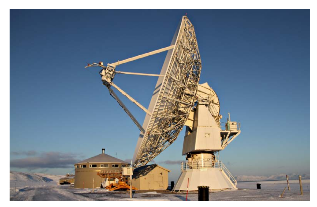
The Norwegian Mapping Authority is getting NOK 23.1 million to start construction of a new observatory in Ny-Ålesund.

The Norwegian Mapping Authority (NMA) has received NOK 23.1 million to start building a new geodetic observatory which will permit accurate climate monitoring in the high north. This funding has been provided in the revised national planning budget, and the government has also secured further financing for the planned facility.