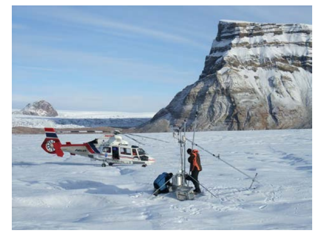
Field work on the glacier.

http://sverdrup.npolar.no/sverdrup_booking/project