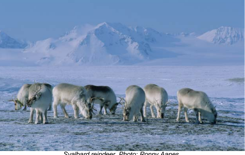
Svalbard reindeer.